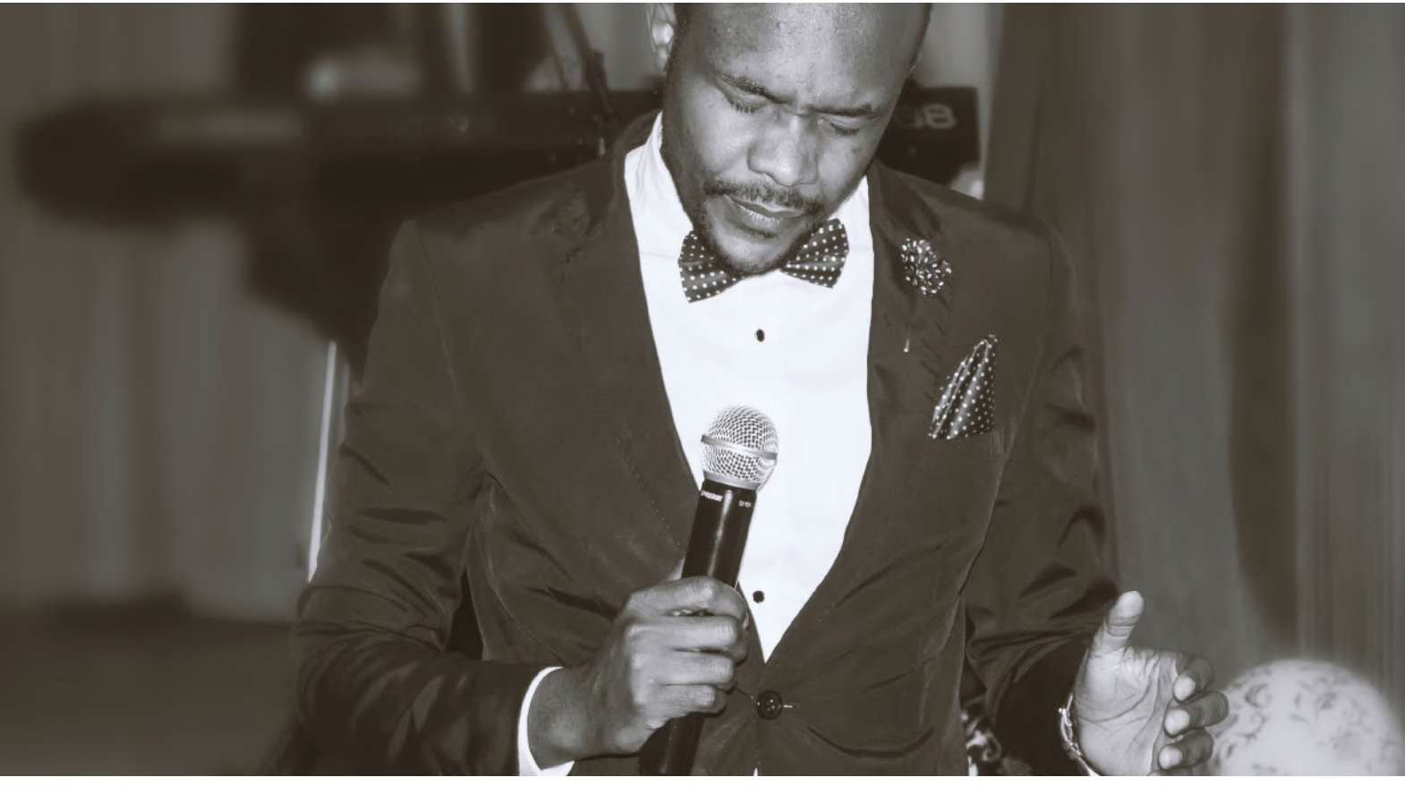
"He who walks with the wise will become wise..." Proverbs 13: 20a

Before walking with someone, you meet them. Every situation in our lives is an opportunity to encounter something or rather to meet somebody. Are you someone that is addicted to drugs or alcohol abuse? Have you been going from relationship to relationship? Put in mind that those situations are opportunities to encounter someone.